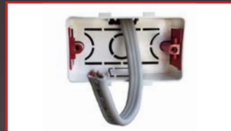
Place quick fit box into position