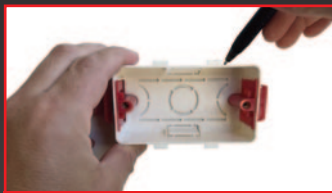
Mark around box in key area