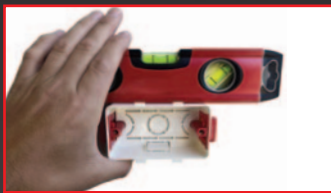
Position box, level off