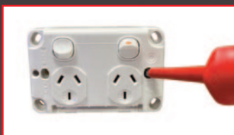
Screw outlet to the quick fit box