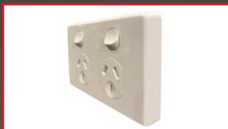
Outlet sits flush on the wall