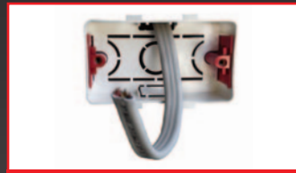
Place quick fit box into position