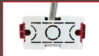
Safely conceals cables