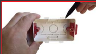
Mark around box in key area