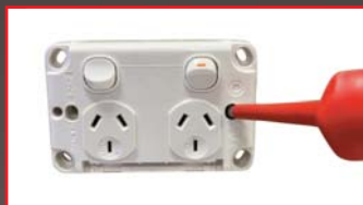
Screw outlet to the quick fit box