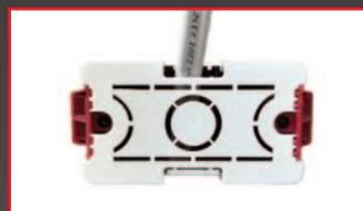
Safely conceals cables