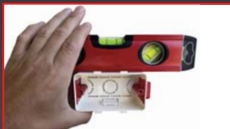
Position box, level off