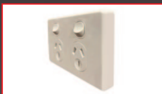
Outlet sits flush on the wall