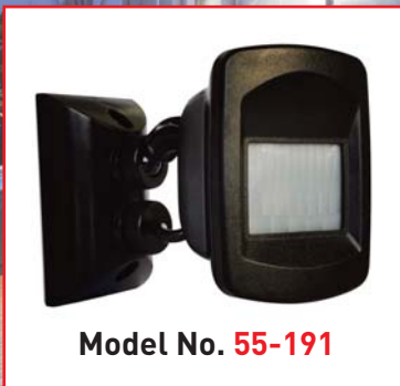
Model No. 55-191