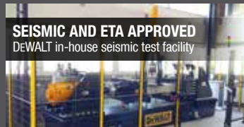
SEISMIC AND ETA APPROVED DeWALT in-house seismic test facility