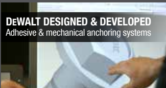
DEWALT DESIGNED & DEVELOPED Adhesive & mechanical anchoring systems

Products complying with European standards or approvals are marked with the CE Marking.