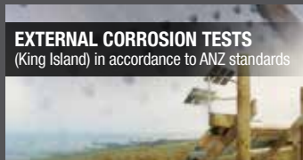
EXTERNAL CORROSION TESTS (King Island) in accordance to ANZ standards