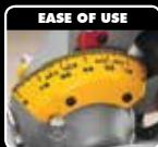
EASE OF USE