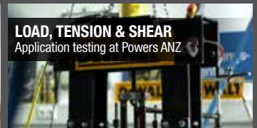
LOAD, TENSION & SHEAR Application testing at Powers ANZ