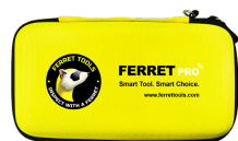
Padded EVA case