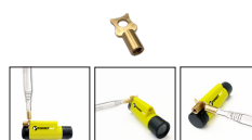
Right angle adaptor