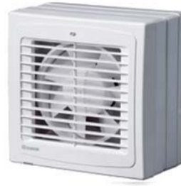
Automatic shutters "Open" position